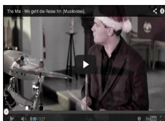
From Germany, The Mix - " Wo geht die Reise hin "